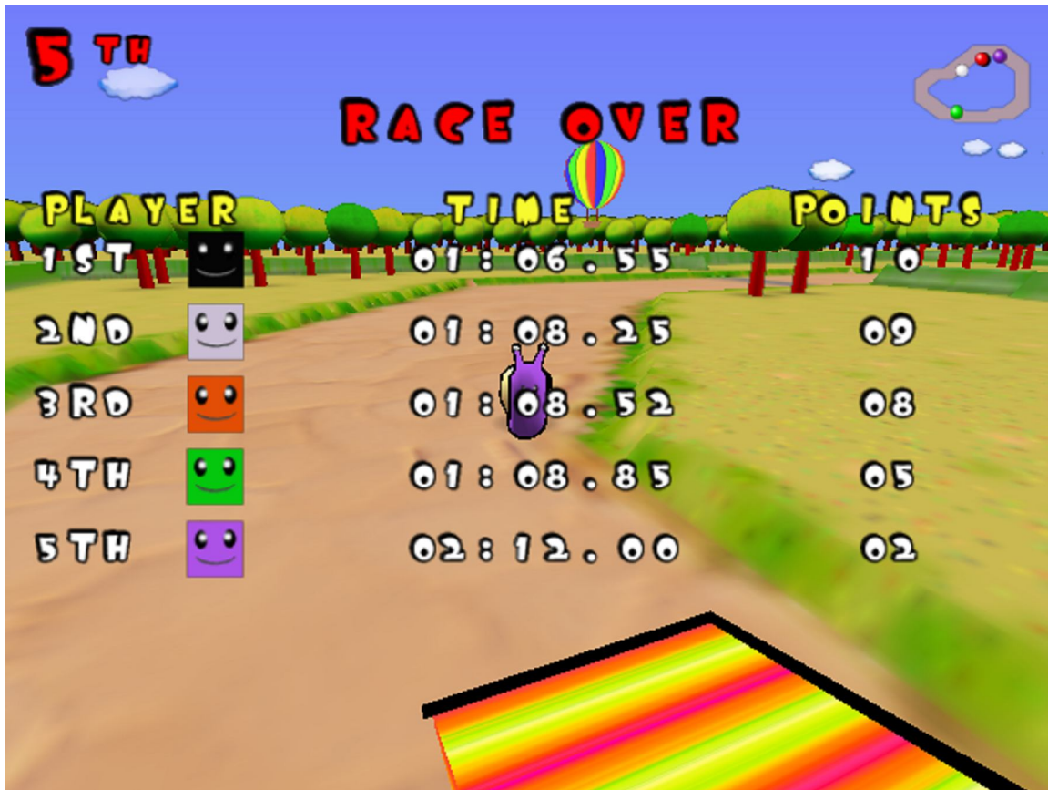
Race over screen

The championship is defined by a series of races, on 4 different tracks. To the end of each race, the players earn a specific number of points, depending on his position, and at the end of all races, the racer with most points will be the winner.