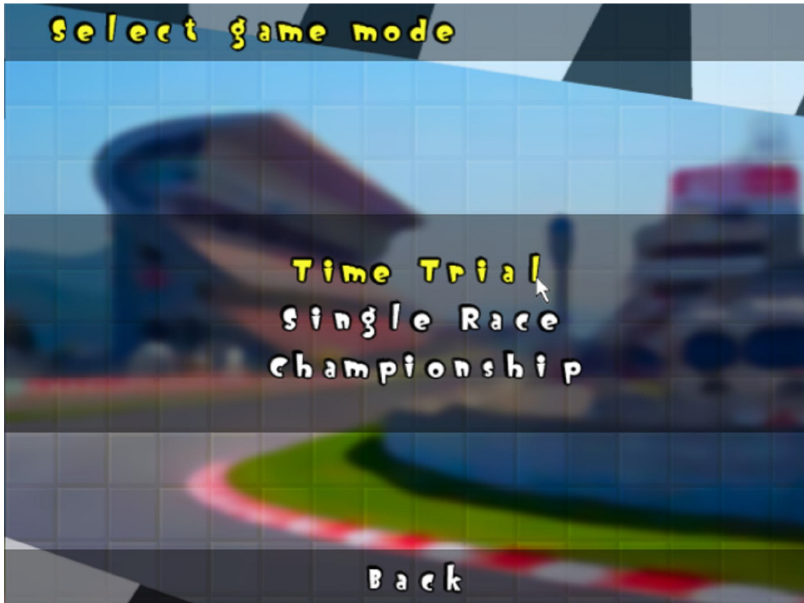
Select game mode screen

After choosing your snail, the screen below will be shown: