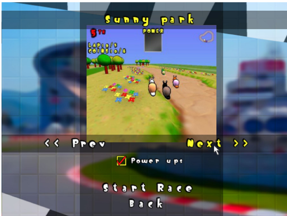
Select track screen

On this screen you can select the track you're going to race. Click on "Next >>" to show the next track, or "<< Prev" to go to the previous one.