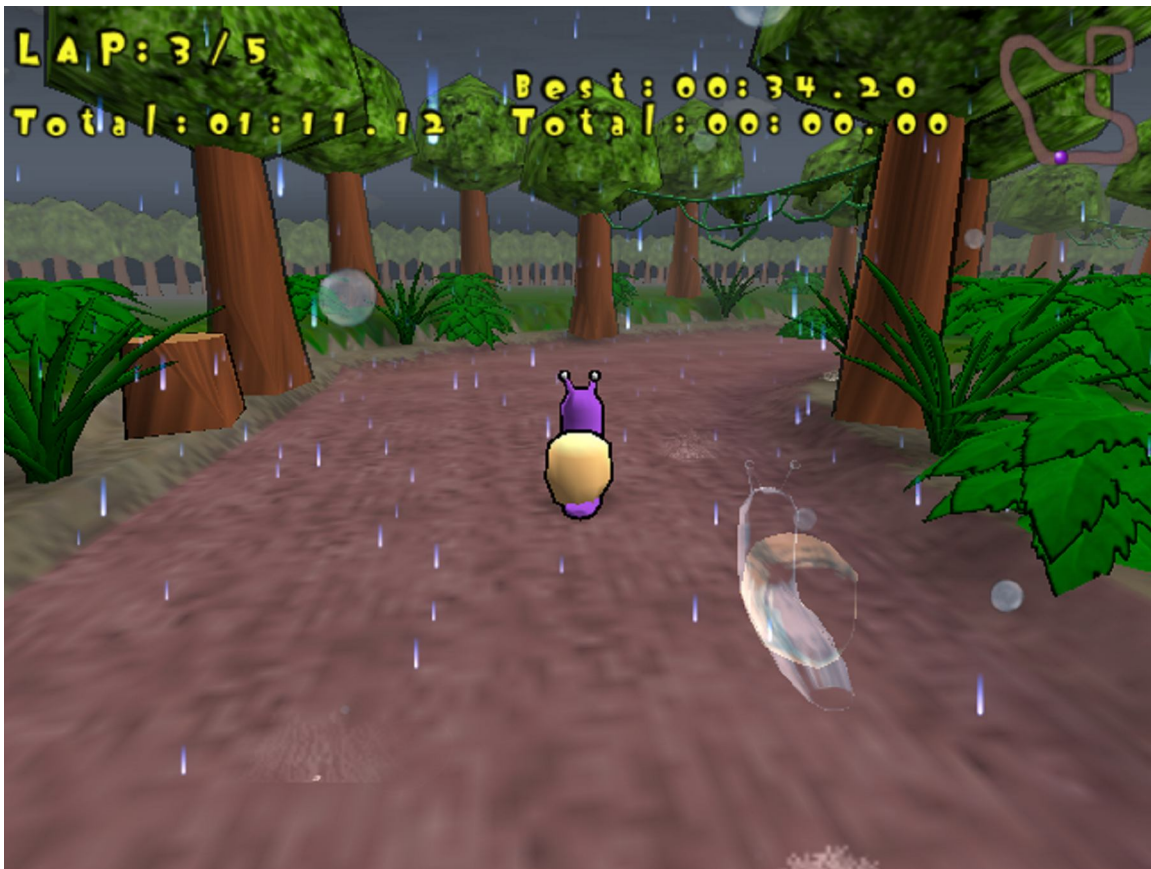
“Time Trial” screen

A cada volta completa, aparece um corredor “fantasma” que mostra o caminho feito pela melhor volta dada pelo jogador.