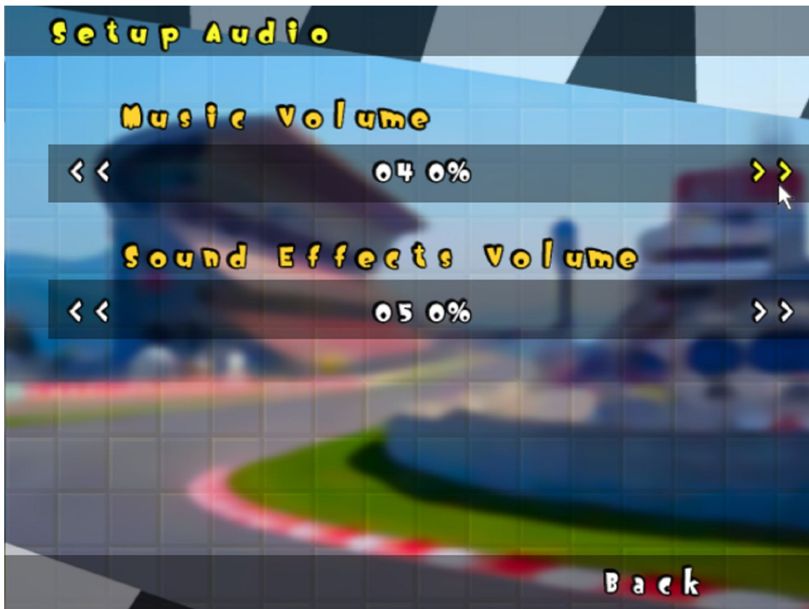
Audio setup screen

On this screen is possible to change the volume of sound effects (voices, explosions, etc) and of in game music. To do this, click on the arrows “<<” and “>>” to increase or decrease the respective volumes.