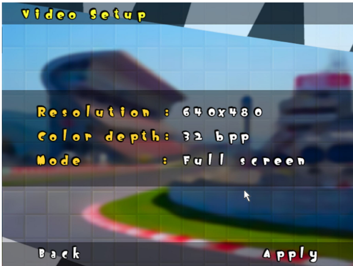
Video setup screen

On the video setup screen you can adjust the game video resolution: click on “800x600” to change the initial resolution. Keep clicking until you find the desired resolution. If the game is running slowly, one of the solutions is to reduce the graphics resolution.