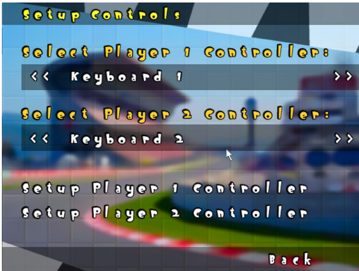
Controller setup screen

Snail Racers supports a variety of controllers: from the definition of 2 keyboard sets (keys on the same keyboard, for 2 players), as “normal” joysticks to Xbox 360 joysticks. When playing with Microsoft’s joysticks, they will vibrate, accordingly to what happens in game.