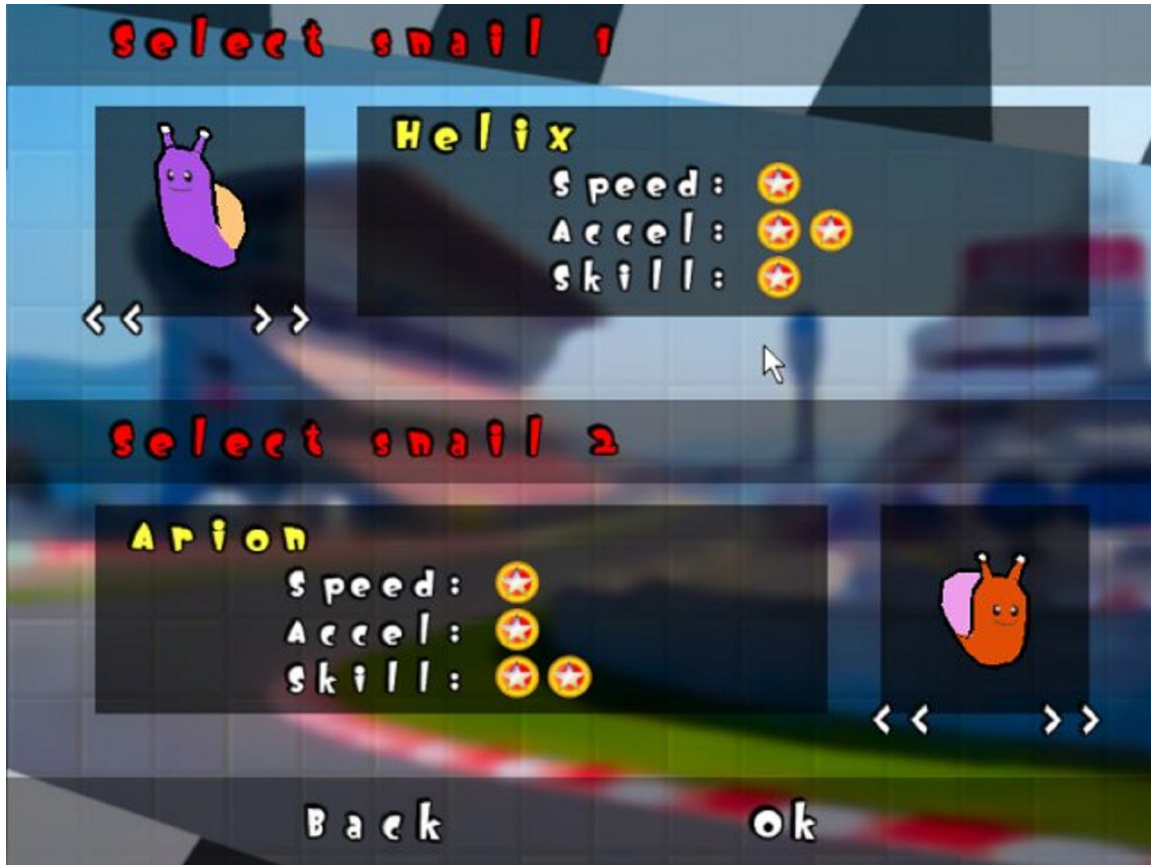
2 Player selection screen

After clicking on “1 Player Game” or “2 Player Game”, you will be taken to another screen where you can select what snail you will race with.